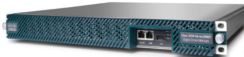
Figure 1. Cisco DCM Series D9901 Digital Content Manager – IP Video Gateway

The DCM Series D9901 IP Video Gateway provides simultaneous transport of uncompressed standard-definition (SD), high-definition (HD), and 3G high definition (3G-HD) SDI video, as well as compressed video using JPEG2000. At the transmitter site, the DCM IP Video Gateway enables SDI video to be carried over 1 Gigabit Ethernet or 10 Gigabit Ethernet. At the receiving site, the DCM IP Video Gateway converts the IP-encapsulated stream back to a baseband SDI video signal.