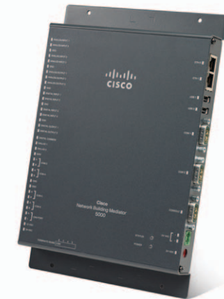
Figure 2. Mediator NBM5000-K9