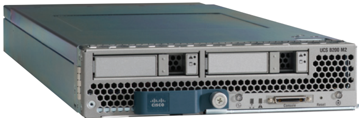
Figure 2. Cisco UCS B200 M2 Blade Server

Cisco's experience and leadership in implementing Oracle environments combined with the performance leap provided by Intel Xeon 5600 series processors have propelled the Cisco B200 M2 Blade Server (Figure 2) to the top of the industry in terms of Oracle E-Business Suite 12.0.4 performance. The solution's integrated performance and superior agility provide a compelling reason to adopt the Cisco Unified Computing System.